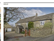
Amberley, GL5 £1,500,000 Freehold

Do you have a property to rent or are you looking to sell your home?