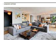
Sunset Lodge, Cotswolds, GL7 £3,000,000 Freehold